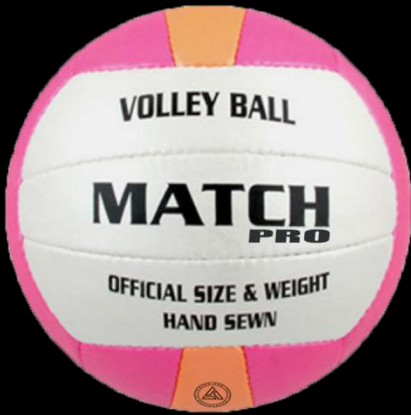
“MATCH PRO VOLLEYBALL” ART # AVB-010210

Hand Stitched, Synthetic Leather high quality with special coating, hard wearing, soft and leather feel, ensuring shape and circumference stability of the ball. Fitted with natural latex bladder, supple, balanced & good air retention.