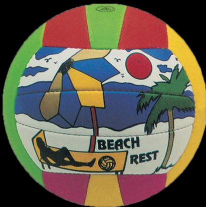
“BEACH REST VOLLEYBALL” ART # AVB-010230

Hand Stitched, Training Volleyball , made from synthetic leather. Fitted with natural latex bladder, supple, balanced & good air retention.